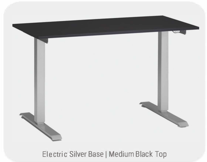
Electric Silver Base | Medium Black Top